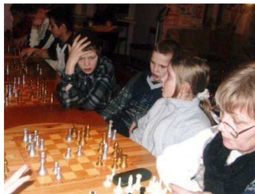
Children playing chess, Estonia

In partnership with the Rotary Club of Tallinn and Action Estonia of the Ottawa Estonian Society, we supported several educational and cultural projects for disadvantaged children in Valga, Kohila, Tartu, Viljandi, Johvi and Sillamae.