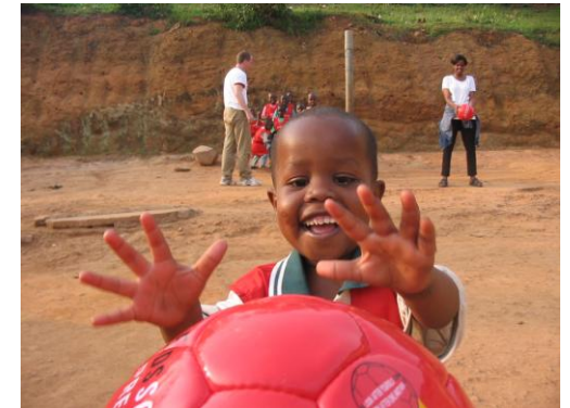
Right To Play, Africa

With the Rotary Club of Karaganda, we sponsored a promising student from a youth home toward higher education. The support provided was in the form of a scholarship and living expenses.