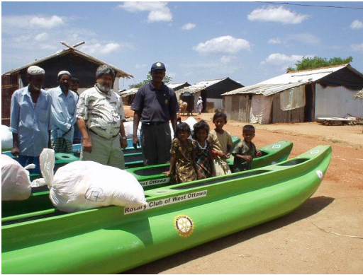
Rotaboats, Sri Lanka